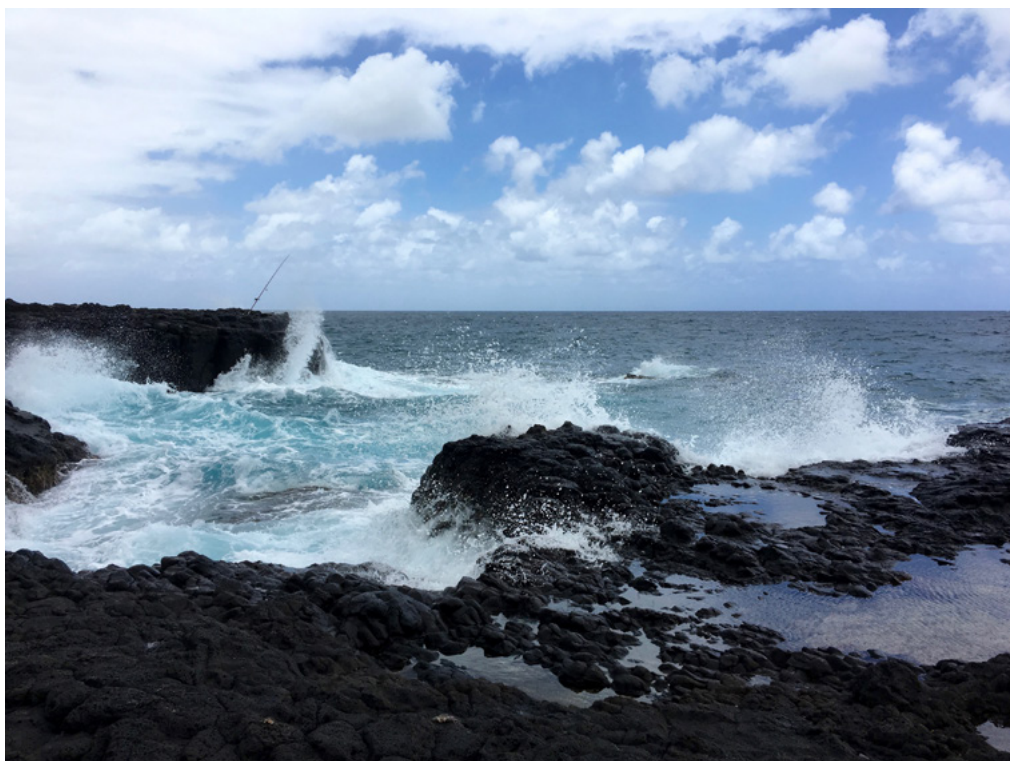
LONE POLE Shelbi Brown, Class of 2019