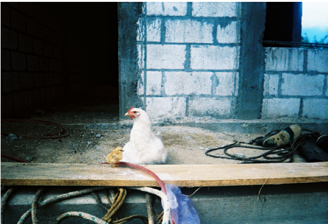
SURVIVE (TOP) & CHICK & CHICKEN (LEFT)